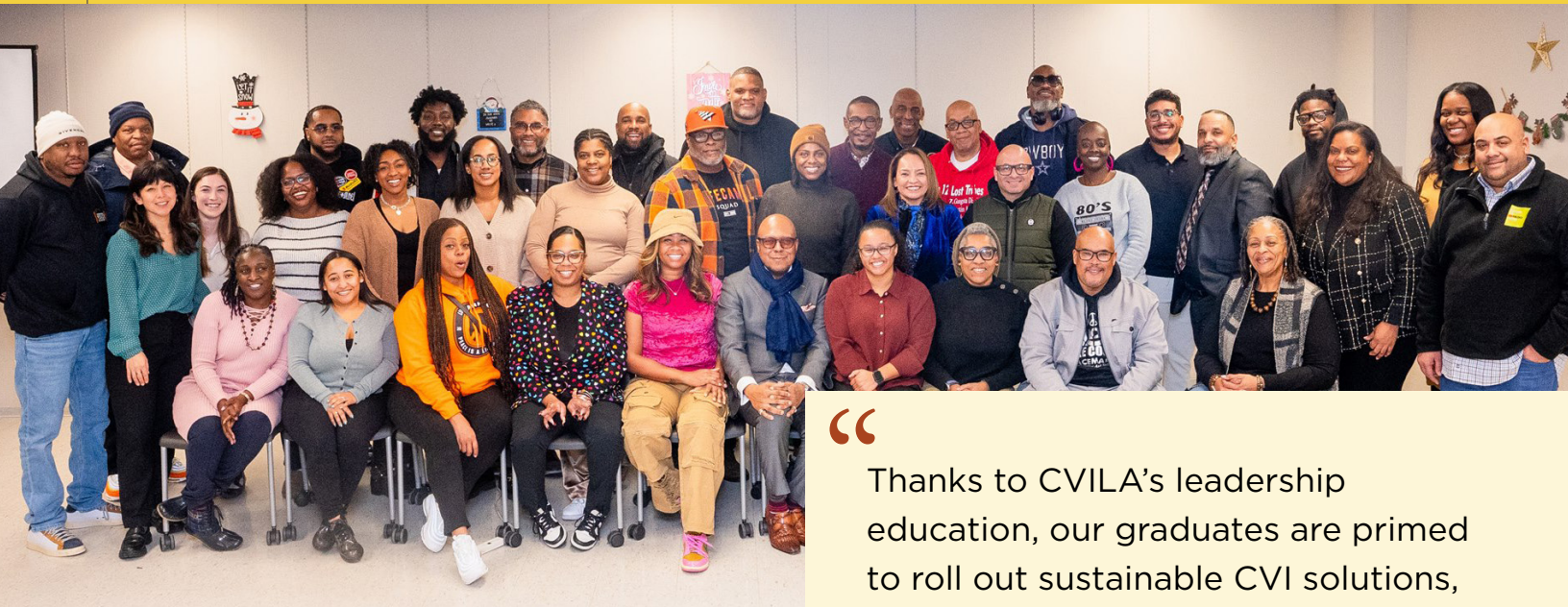
CVILA students and instructors in Chicago, IL for an Immersive Lab with UCAN.

Empowering Leaders to Close America's Safety Gap